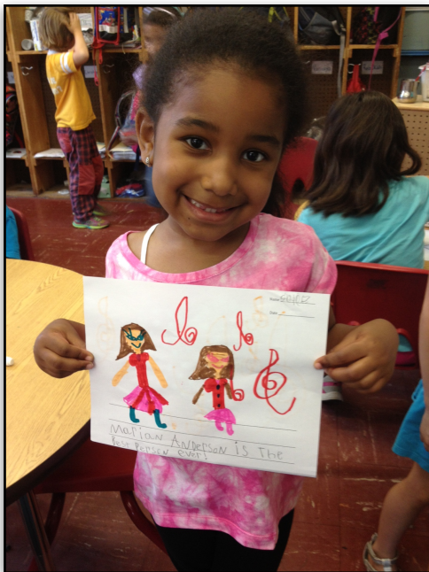
A K/1 student at Ella Baker School's new found enthusiasm for Marian Anderson . She writes: Marian Anderson is the best person ever!