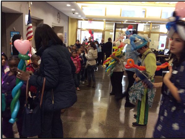
On #GivingTuesday , students received balloon creations while entering Kaufmann Concert Hall on December 2 at 92Y.