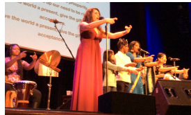
WOMEN OF THE WORLD