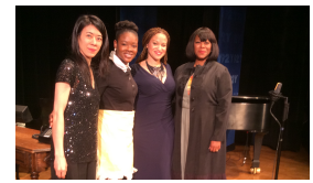
MARIAN ANDERSON A MUSICAL MEMOIRE