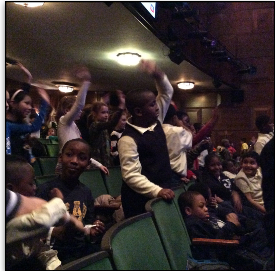
Women of the World had students on their feet dancing a traditional African song.