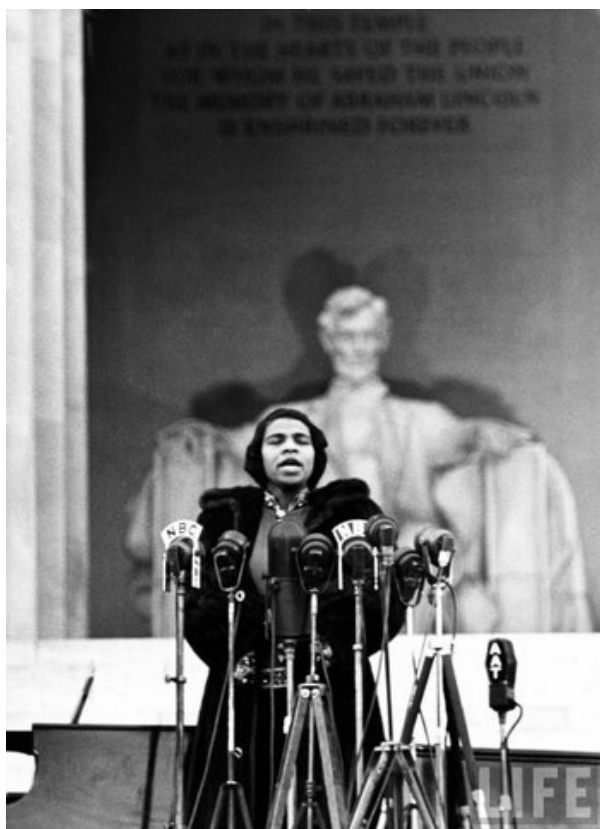
Marian Anderson performing at the Lincoln Memorial on April 9, 1939

Hudson. Teachers commented on the success of students learning about Marian Anderson's challenges and achievements in life and her contribution to the musical fabric of our nation. Overall, the unit of study introduced students to a piece of US history and compelled them to see how one person, despite disabling obstacles, was able to change it.